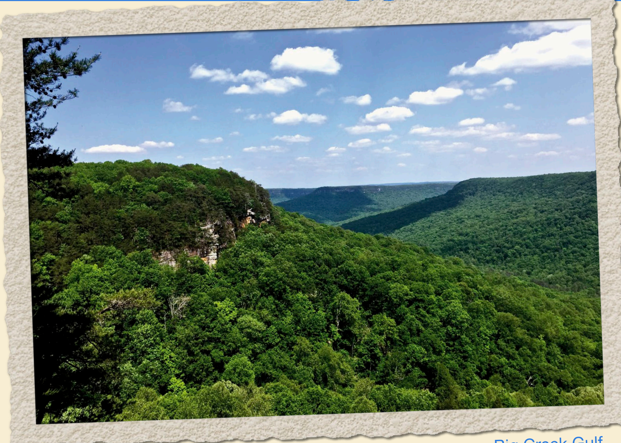
Big Creek Gulf