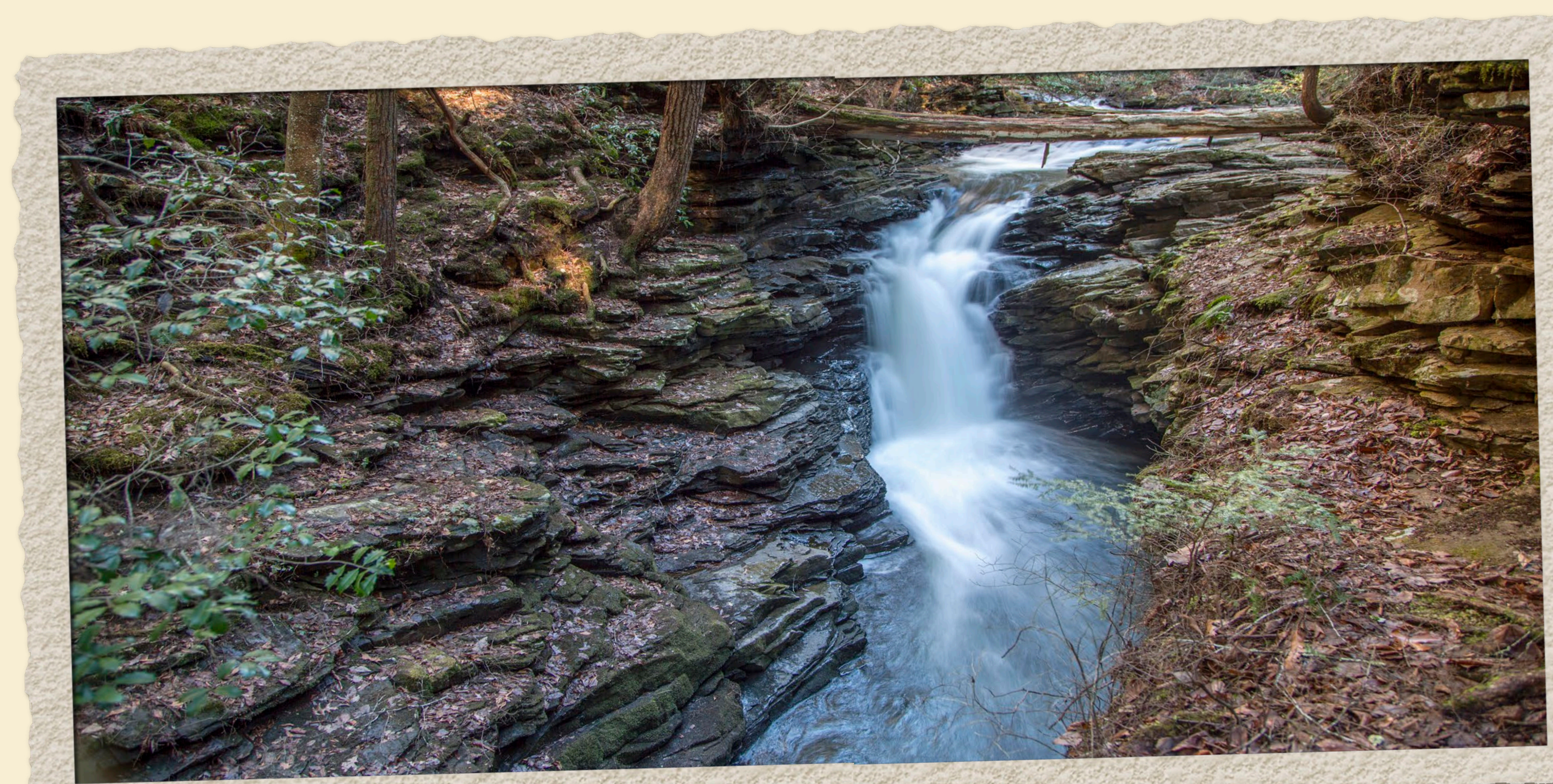
Black Canyon Cascade

NOTE: All caves are closed from September to May, to control the spread of white-nose syndrome, a disease deadly to the many populations of bats who call our caves home. Please respect the health of our bat populations!