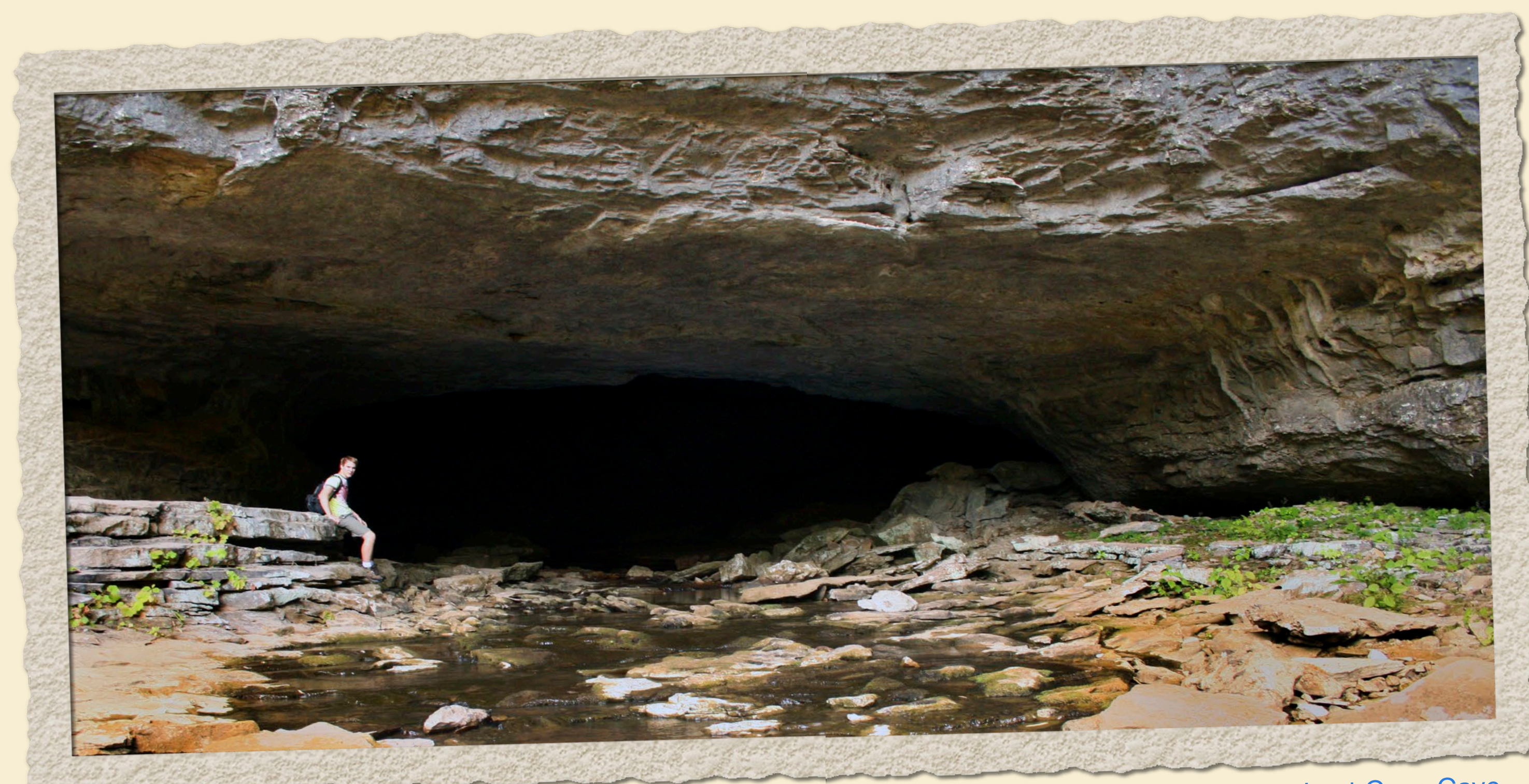
Lost Cove Cave

NOTE: These are mainly swimming areas at the base of waterfalls. They are natural “plunge pools,” formed by the waterfalls, are of varying depths, and frequently have large rocks just beneath the surface. NEVER jump off falls or elevated rocks into plunge pools. Some of our most serious visitor injuries occur as a result of ignoring this guidance. Exposed rocks appearing wet and “black” are extremely slick with algae. Avoid them!