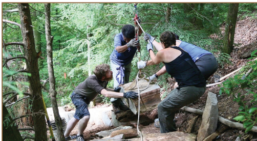
Trail Reroutes & Maintenance (Fiery Gizzard)