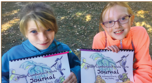
New 4th Grade Education Program