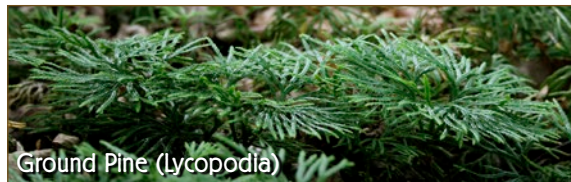
Ground Pine (Lycopodia)

This trail descends about 150 feet to Firescald Creek and the Blue Hole. It's easy for most of the way, with some steeply rocky going at the end. Starting at the junction, the trail is a total of 0.8 mile out and back. The forest here is made up of Virginia pine (twisty needles in pairs), American holly in the understory, Canadian hemlock, and fewer hardwoods than in some other areas nearby. You can find ground pine (Lycopodia) beside the trail. Its spores were dried and then ground to powder that was used in old-time flash photography. Both the ground pine and the hemlocks are here because around 12,000 years ago, the climate was much cooler due to glaciers north of us. Those plants that like cooler weather have retreated to the coves of the Plateau for refuge.