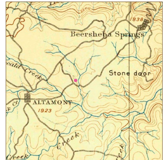
LEFT: Foundation of the Greeter Home Place, the location of which is indicated with a red dot on the map at right. ABOVE: A “marker tree...?” RIGHT: This 1897 map also shows the route of the original Beersheba-to-Altamont road, which ran through this area.

Don't forget to download the companion GPS Trail Guide (.kml file) for this hike at FriendsOfSouthCumberland.org/downloadable-maps